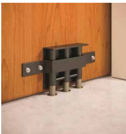
Fig. 2: Examples of various classroom barricade devices.