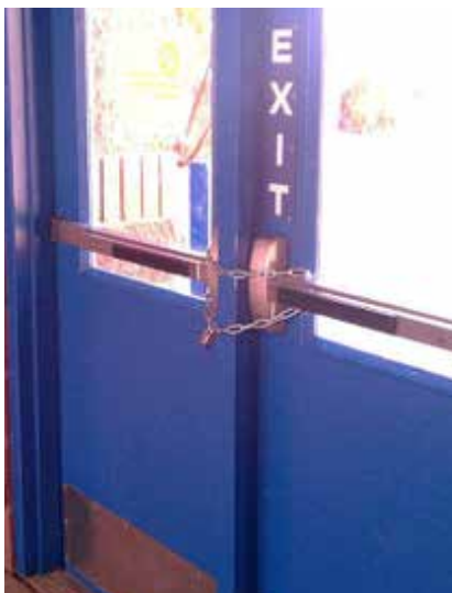
Fig. 1: Exit doors in a school, chained to provide security. This locking method does not meet IBC, IFC, or NFPA 101 requirements for free egress.

Barricade devices are perceived to be generally less expensive to purchase, and easier to procure and install than traditional security devices such as locksets or access control products. While securing the door with a classroom barricade device may seem to address the immediate need for security, one should consider the safety concerns associated with this practice.